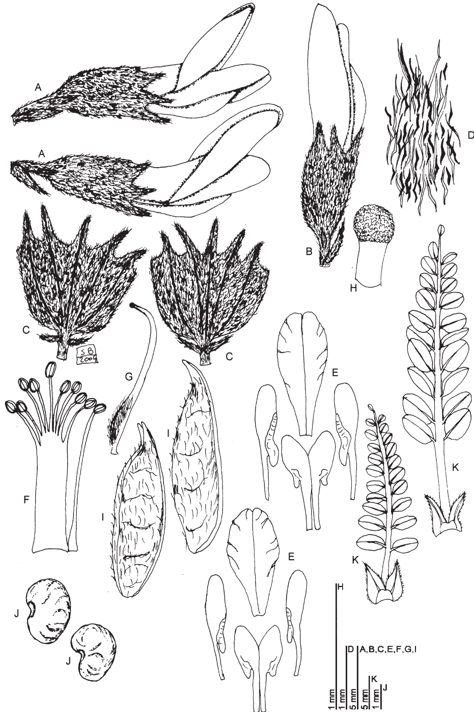
Fig. 1. Astragalus genargenteus – A: flowers; B: flower bud; C: opened calyces; D: calyx indumentum; E: petals; F: stamens; G: pistil; H: stigma; I: legumes; J: seeds; K: leaves. – Drawn after material from Bruncu Spina in Mt Gennargentu (locus classicus).