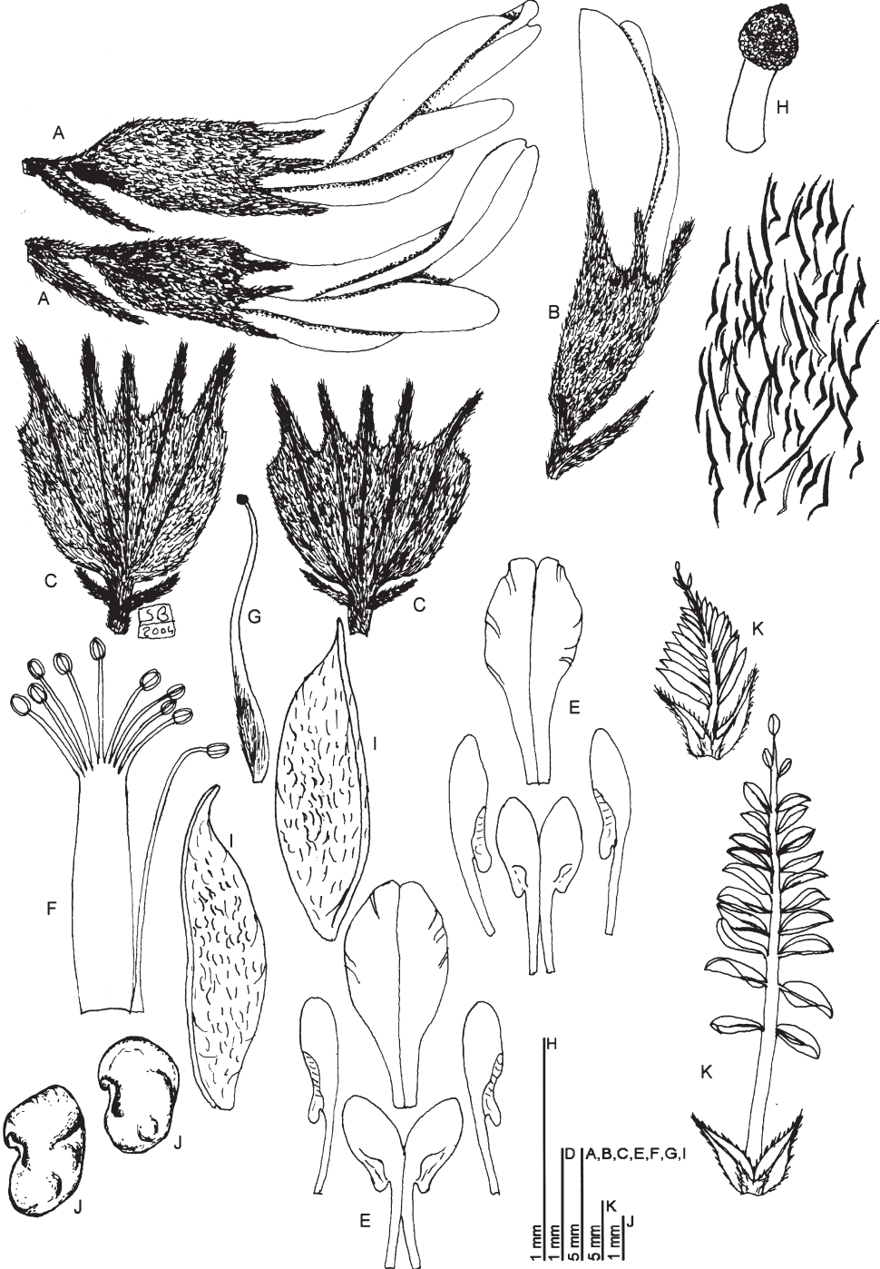
Fig. 3. Astragalus greuteri – A: flowers; B: flower bud; C: open calyces; D: calyx indumentum; E: petals; F: stamens; G: pistil; H: stigma; I: legumes; J: seeds; K: leaves. – Drawn after material from Col di Bavella (locus classicus).